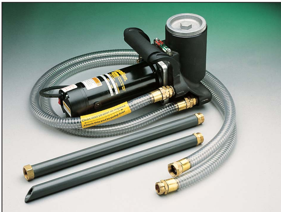
Guardian® Portable Filtration System