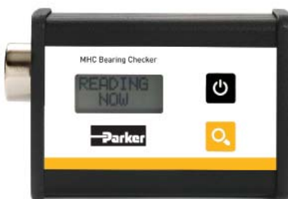
*MHC - Machinery Health Check